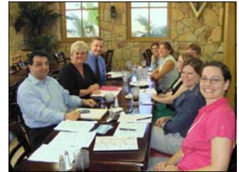
May 14, 2009 Meeting of Galveston County Young Republicans